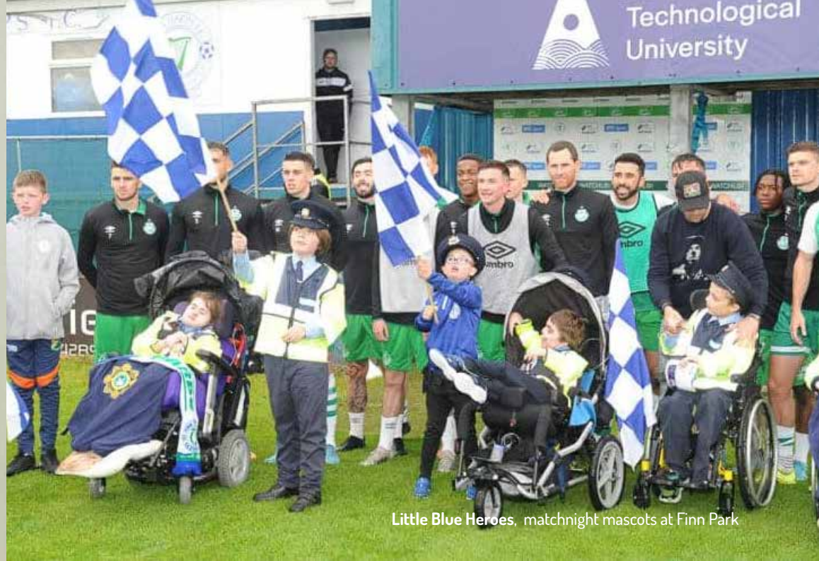
Little Blue Heroes, matchnight mascots at Finn Park