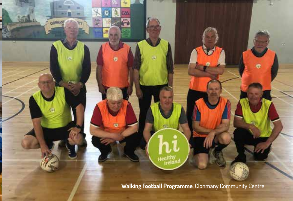
Walking Football Programme, Clonmany Community Centre