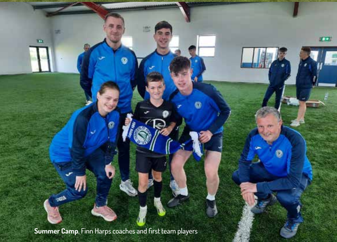
Summer Camp, Finn Harps coaches and first team players