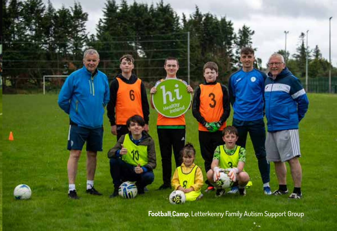
Football Camp, Letterkenny Family Autism Support Group