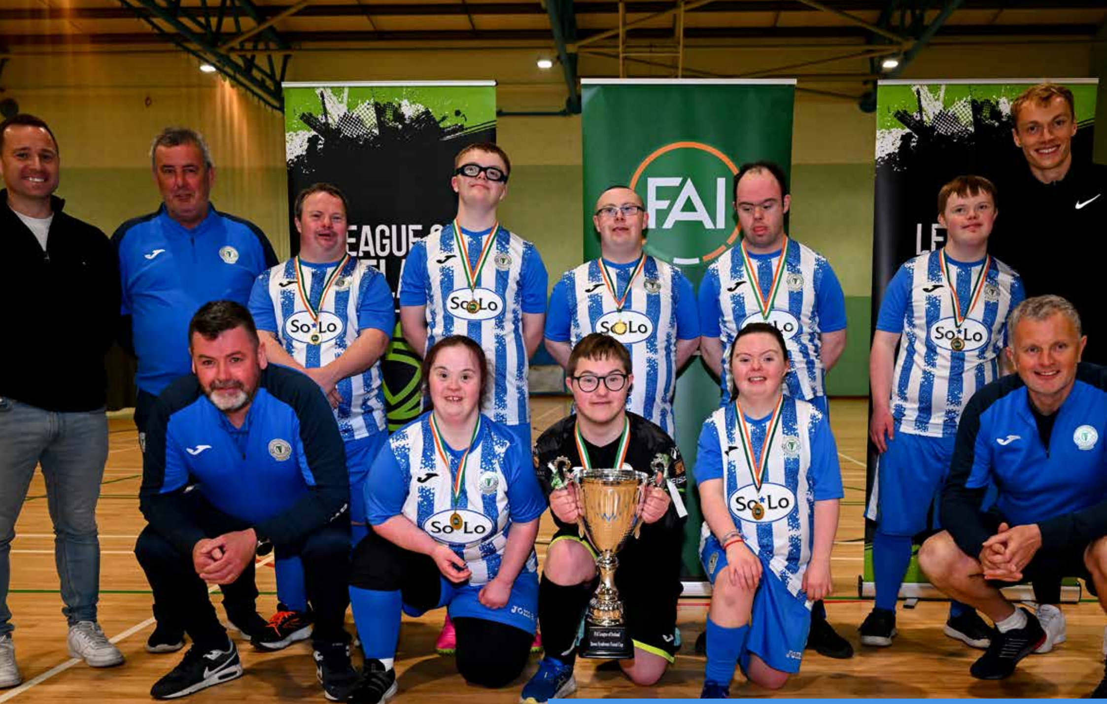
The Finn Harps Down Syndrome Futsal Team were crowned champions of the inaugural League of Ireland Down Syndrome Futsal Cup in June 2024. The squad successfully defended their title and won the Cairdeas Cup in October 2024, winning every game they contested in the tournament.