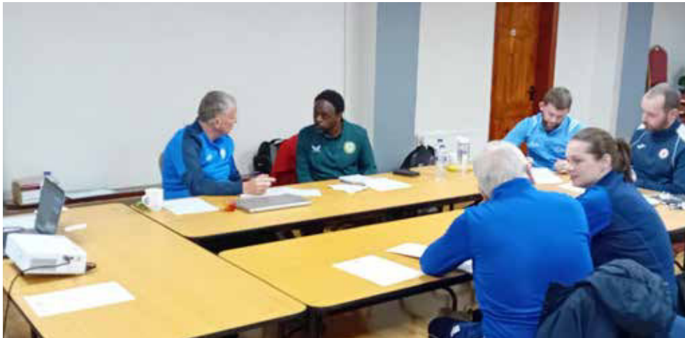
Show Racism the Red Card Tutor Course

Finn Harps FC realises they can play a key role along with their partners throughout the county and has taken this into account when developing this strategy.