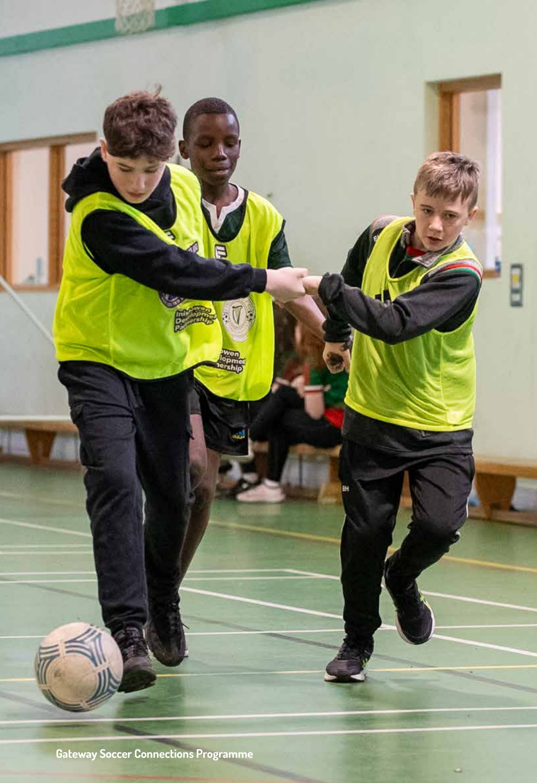
Gateway Soccer Connections Programme