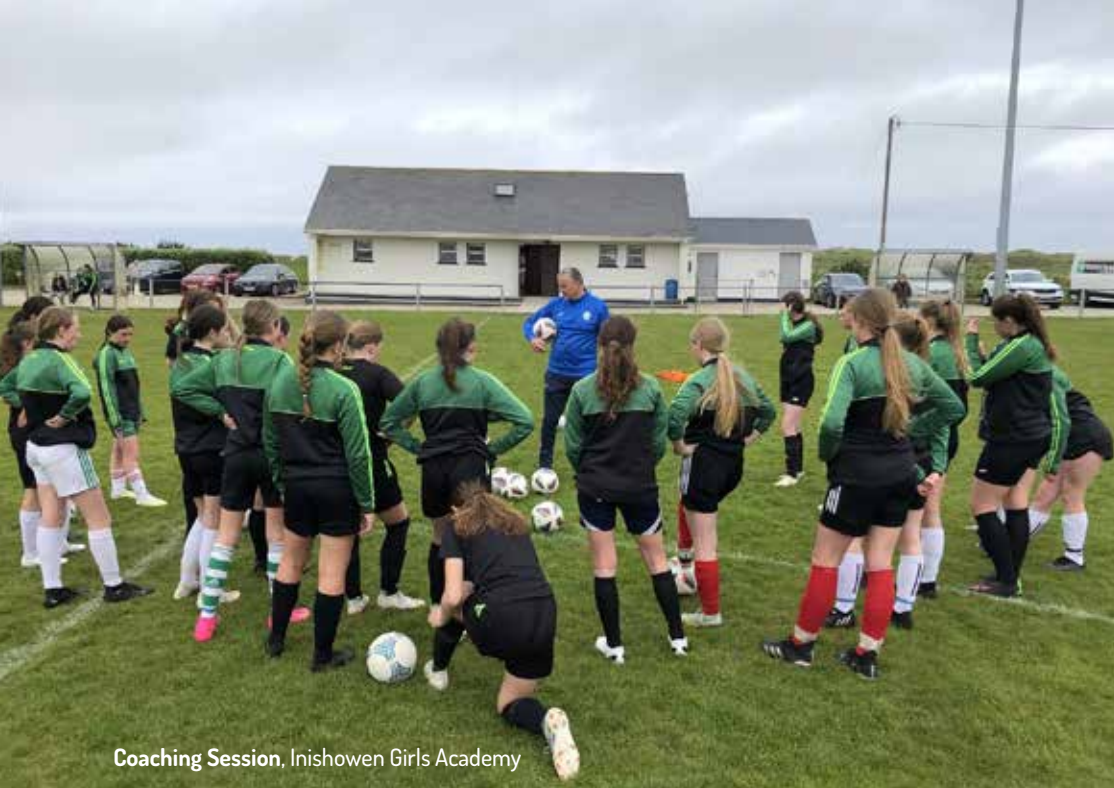
Coaching Session, Inishowen Girls Academy