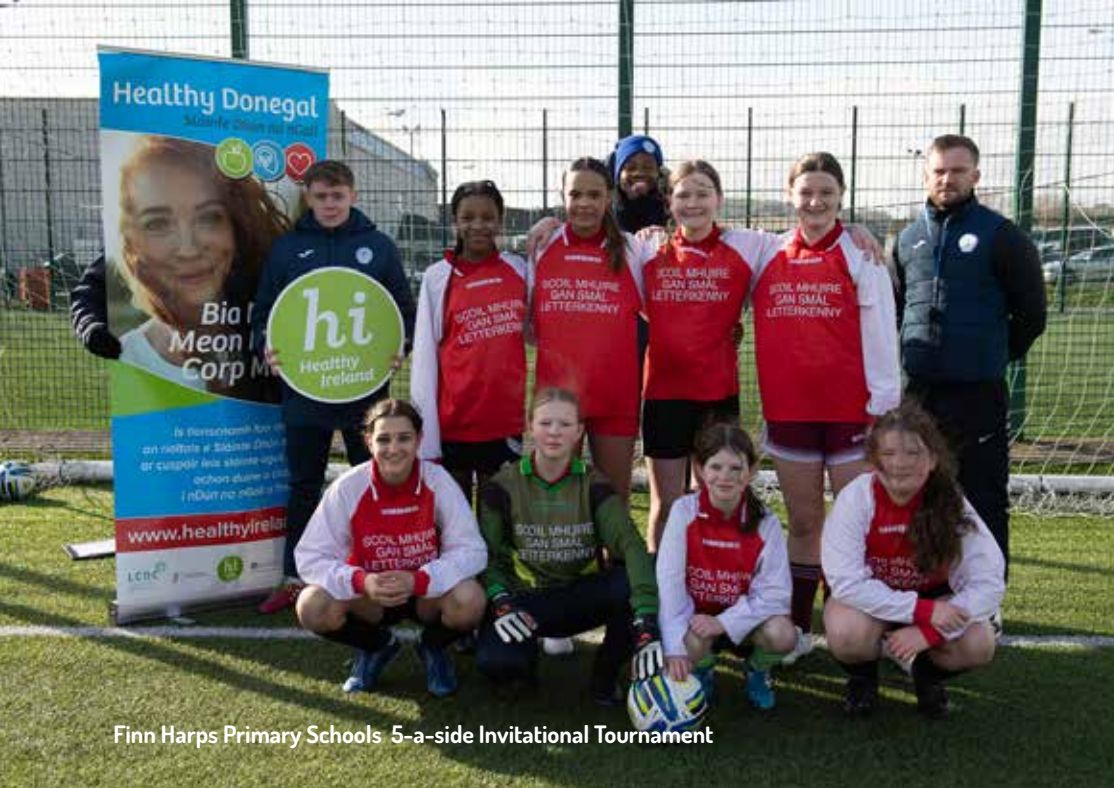
Finn Harps Primary Schools 5-a-side Invitational Tournament