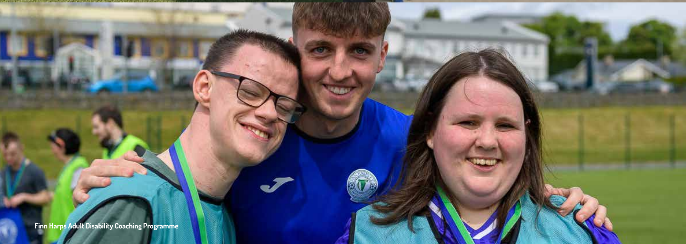
Finn Harps Adult Disability Coaching Programme