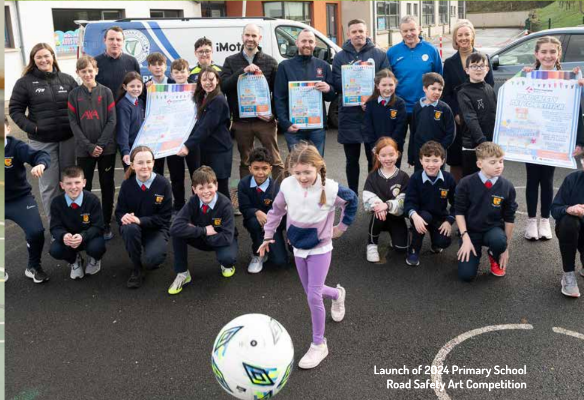
Launch of 2024 Primary School Road Safety Art Competition