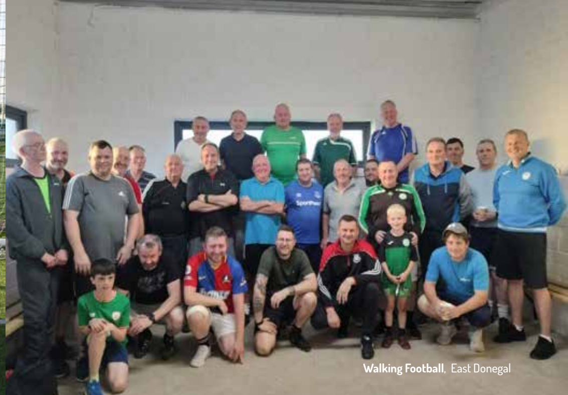
Walking Football, East Donegal