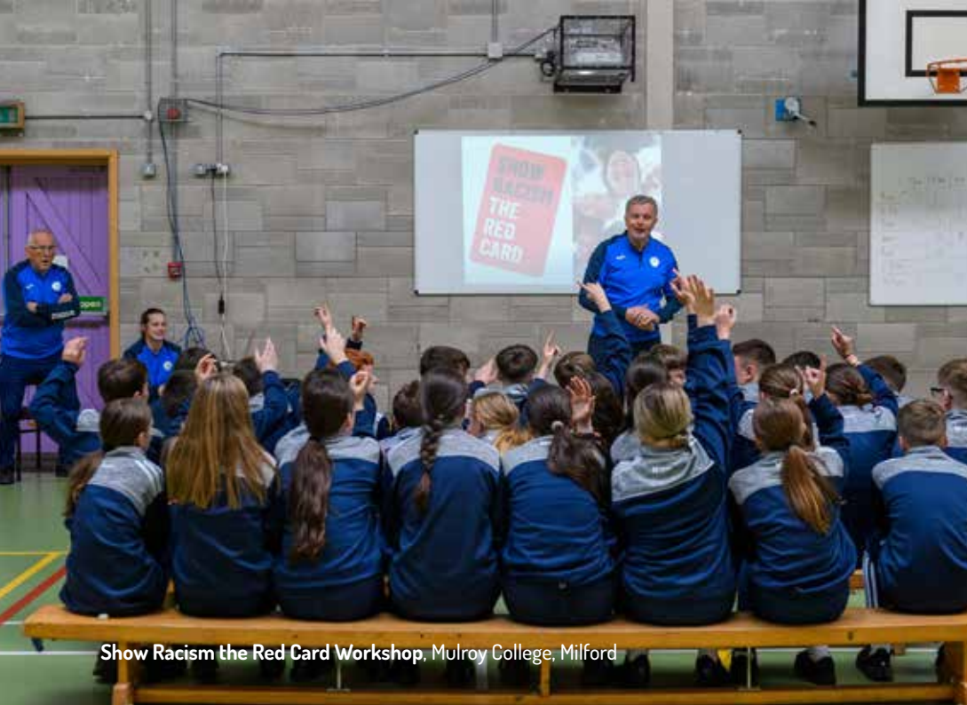
Show Racism the Red Card Workshop, Mulroy College, Milford