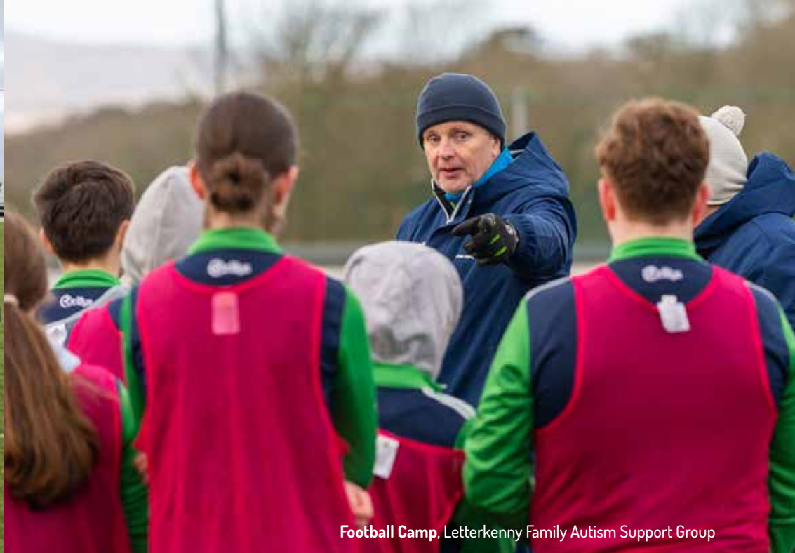
Football Camp, Letterkenny Family Autism Support Group