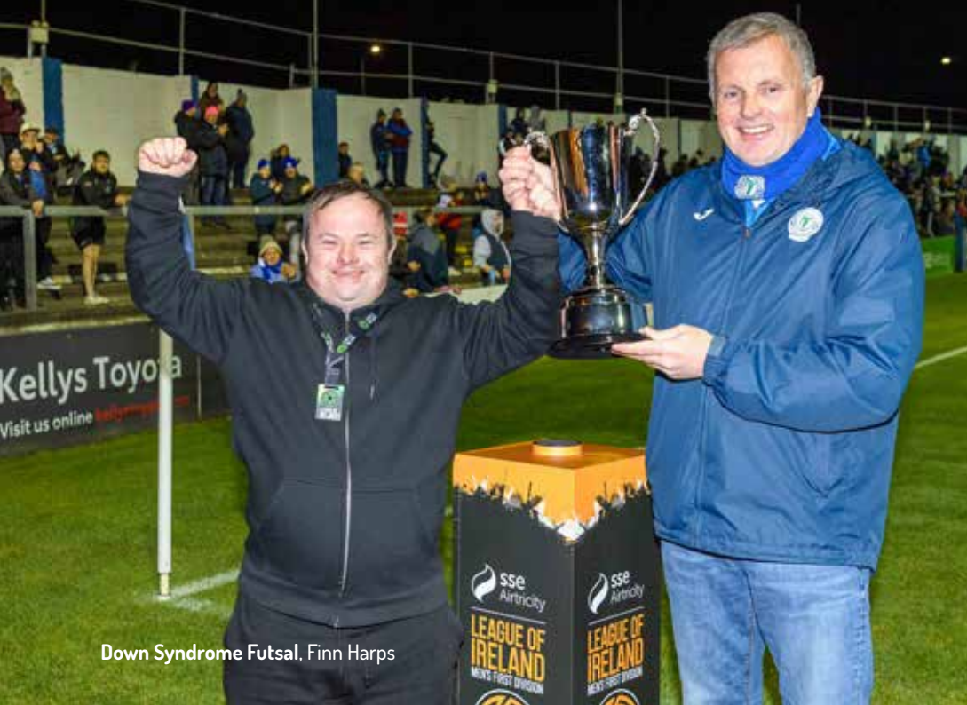
Down Syndrome Futsal, Finn Harps